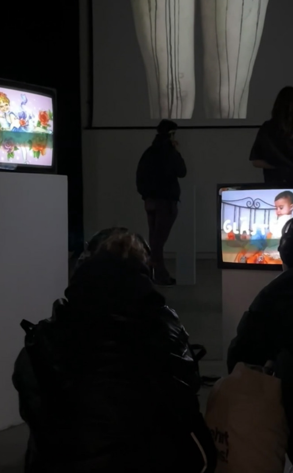
installation view of "Ritter sein" as part of "Modulschau Art Education" exhibition (2023)