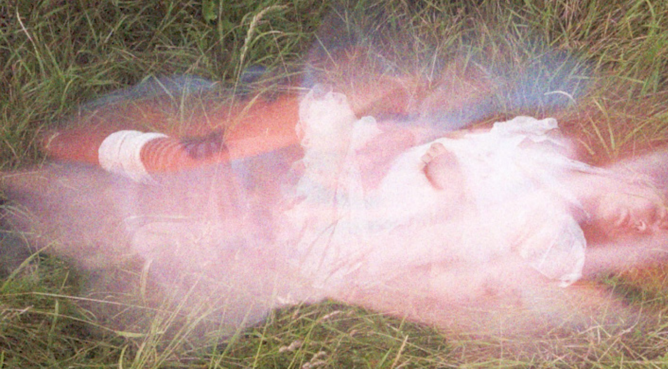
video still(s) from "poppy" HTTPS://VIMEO.COM/973405328