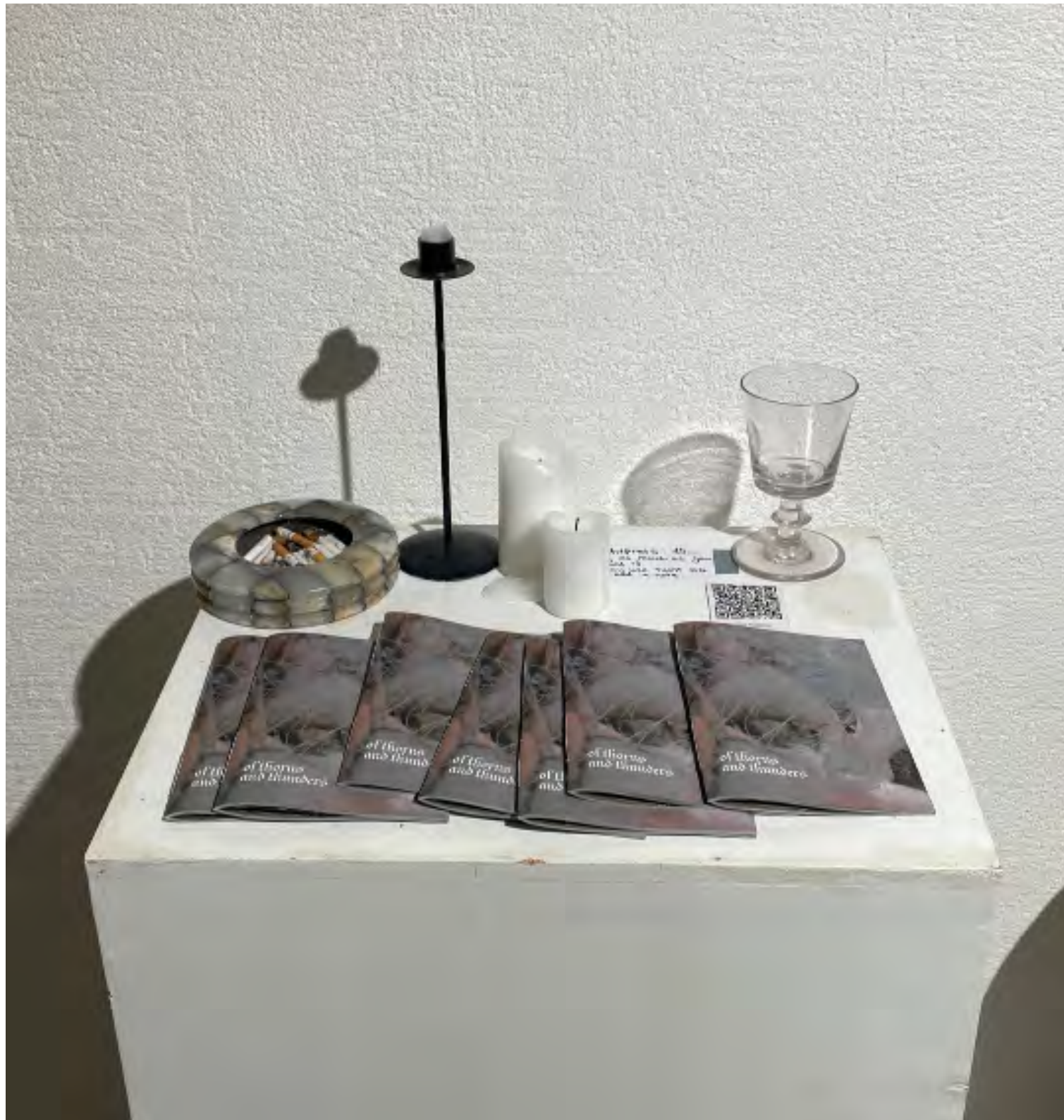
photobooklet designed by luna heidegger A5