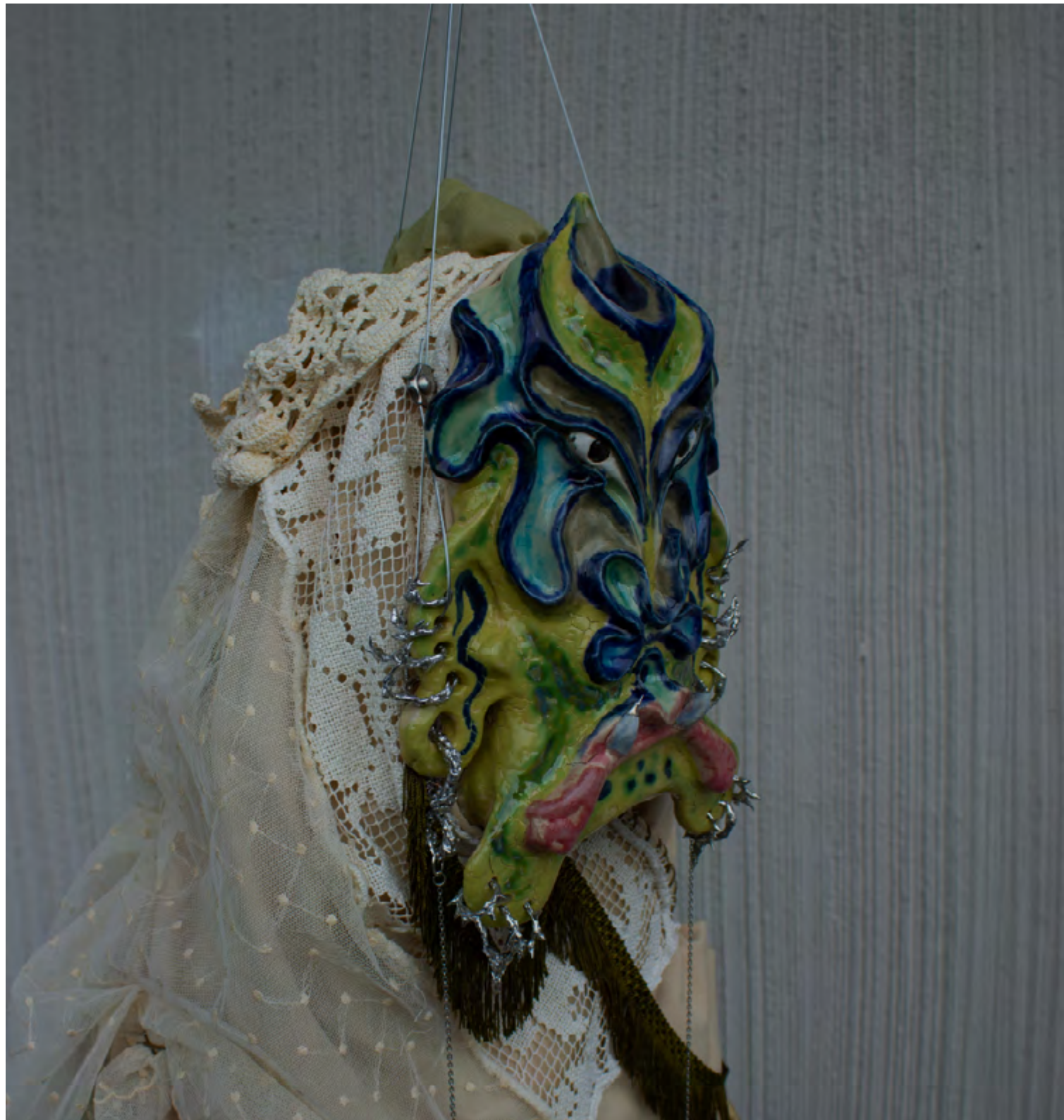
lumithral, 2024 ceramic, textile, solder 150 x 50 x 50cm