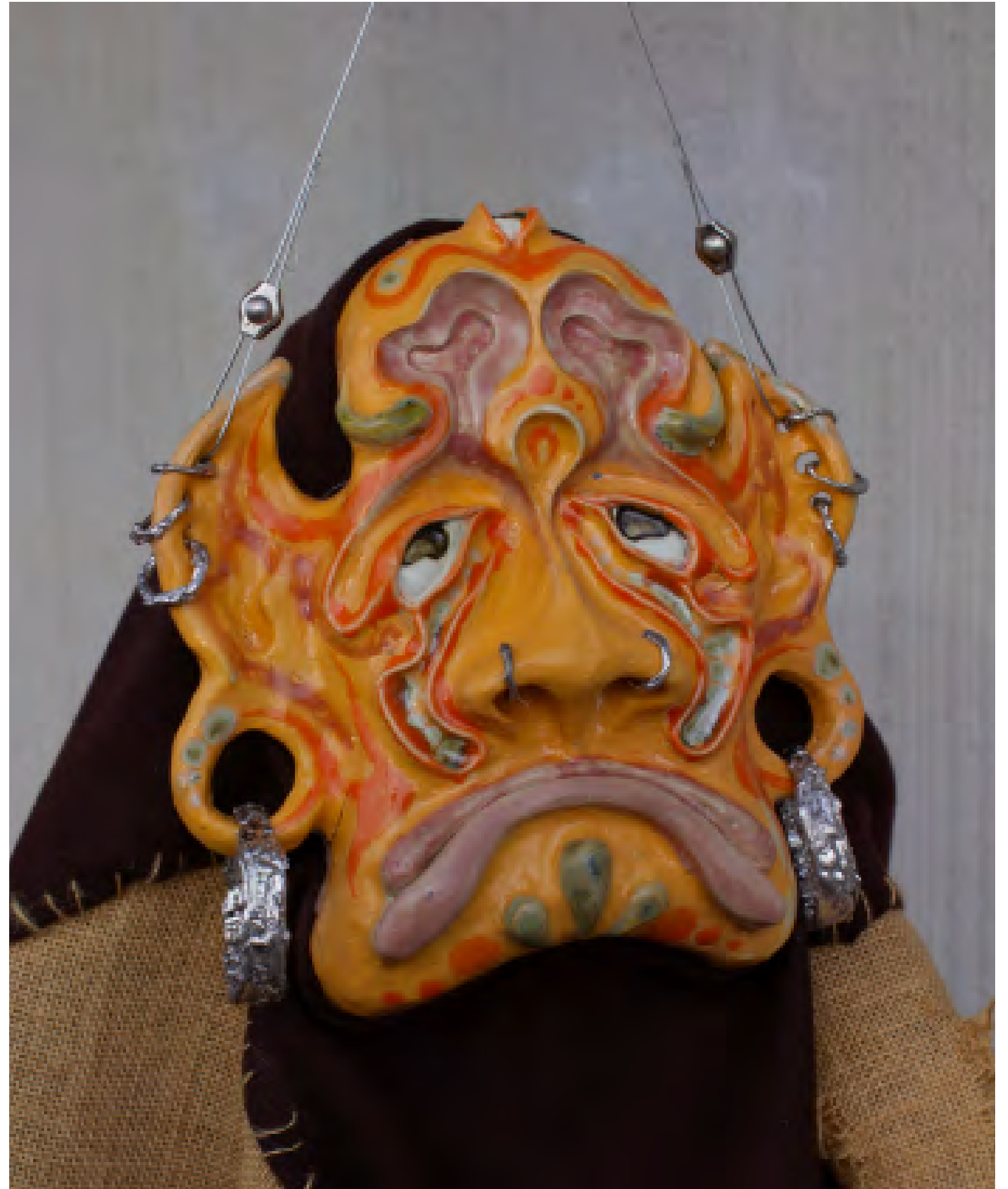
aurelith, 2024 ceramics, textile, solder 200 x 40 x 40cm