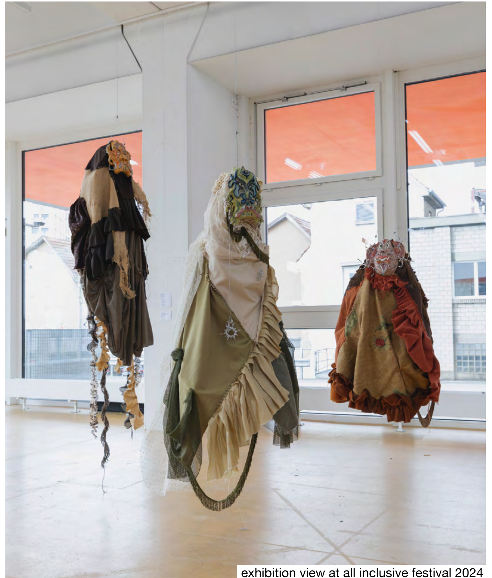
exhibition view at all inclusive festival 2024