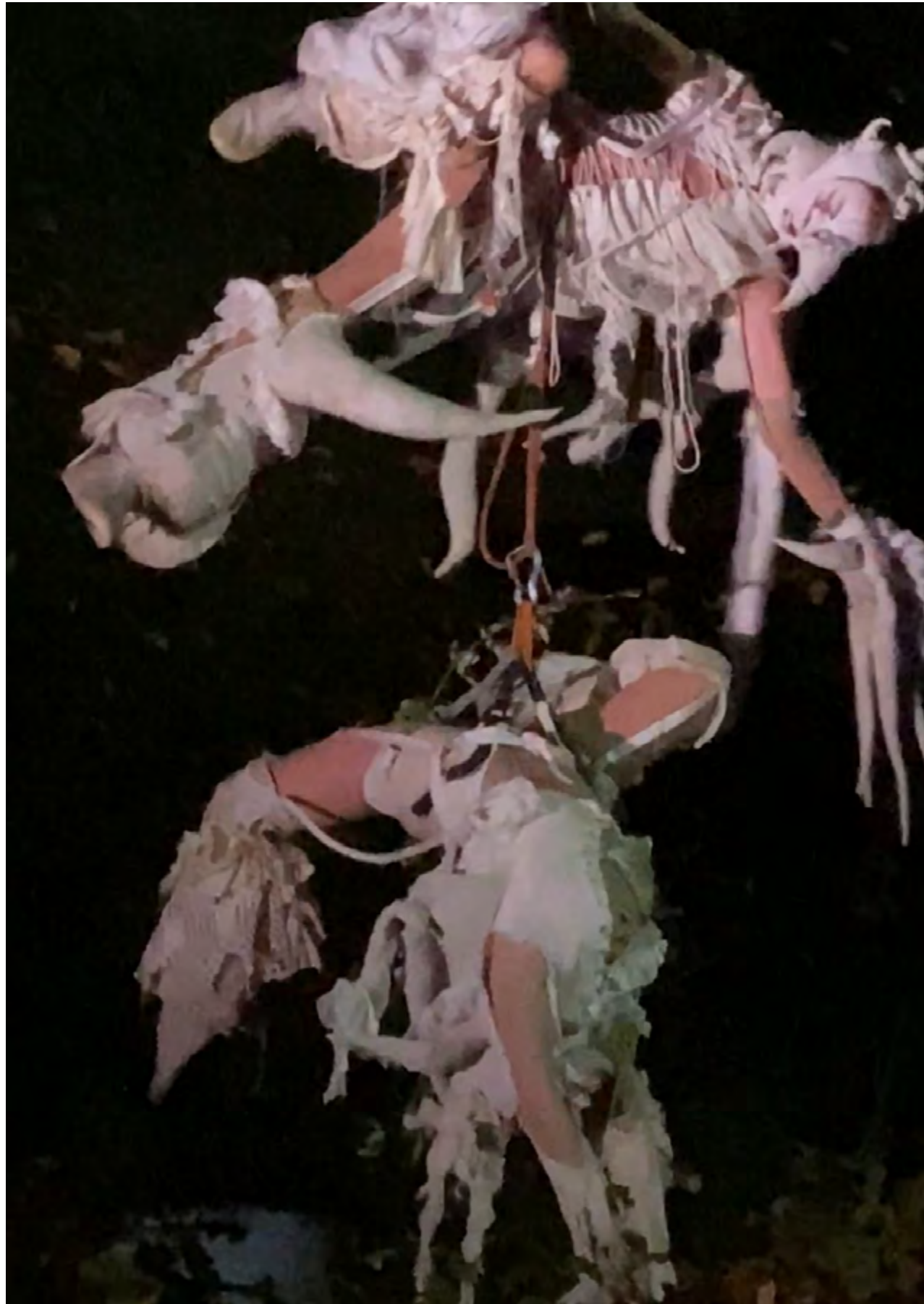
performance at quings academy