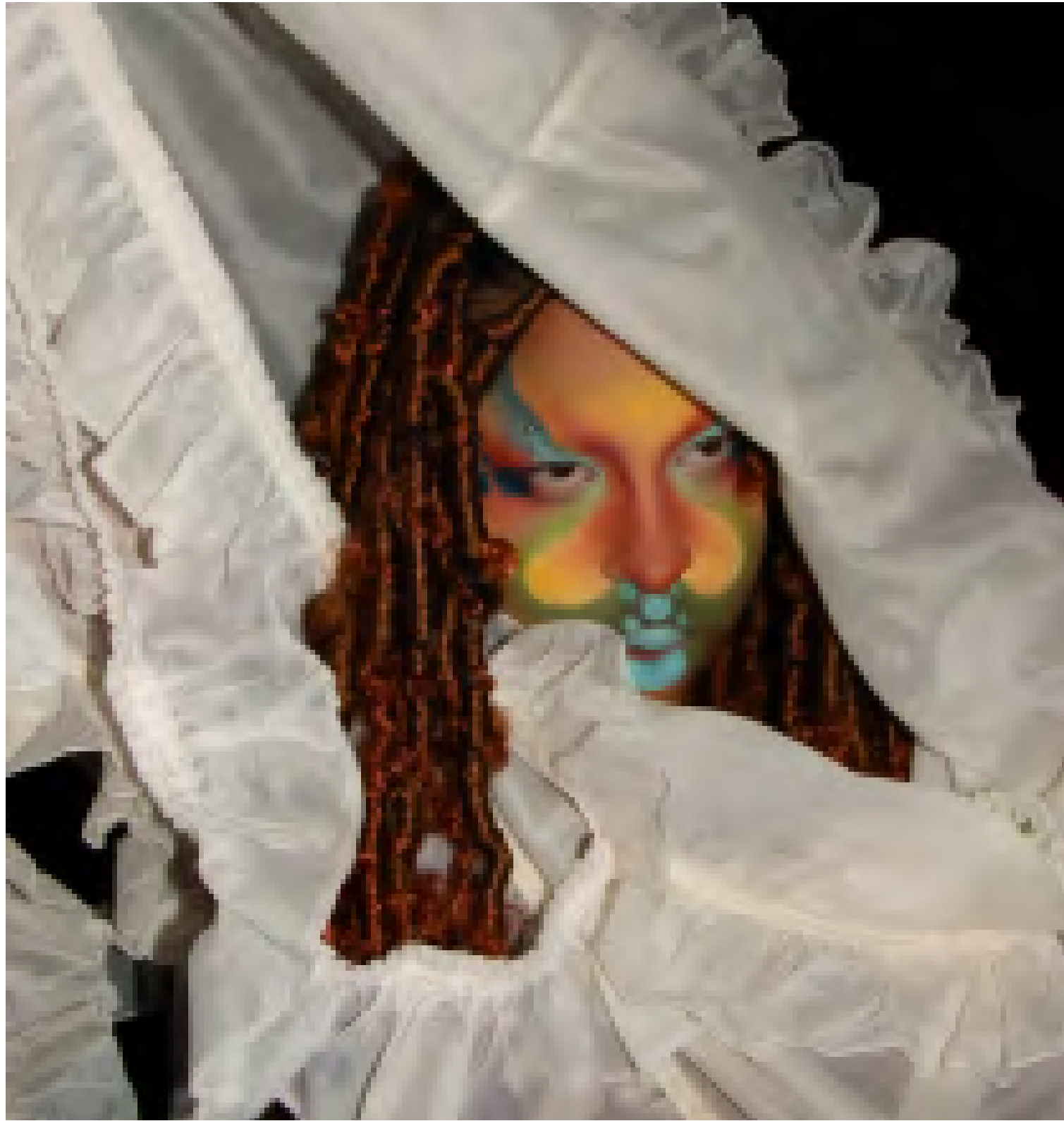
shot in züberwangen SG