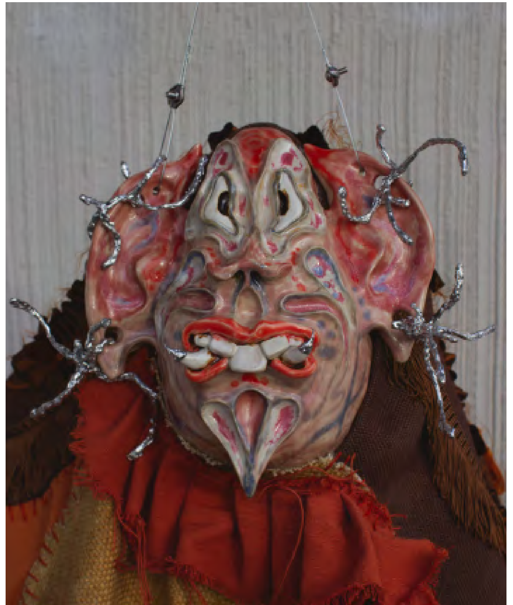
coruvarael, 2024 ceramics, textile, solder 110 x 60 x 60cm