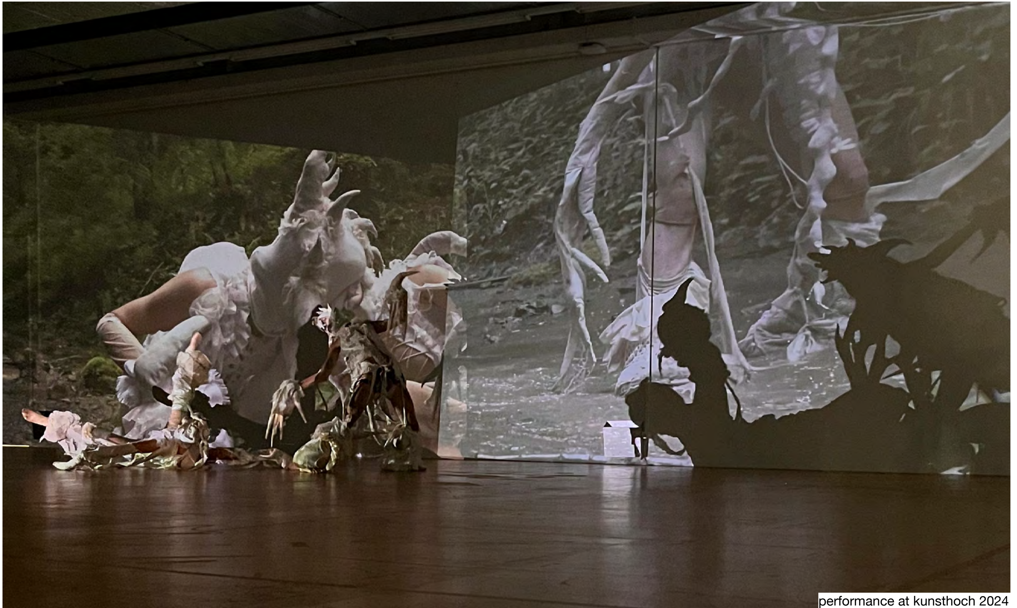
performance at kunsthoch 2024