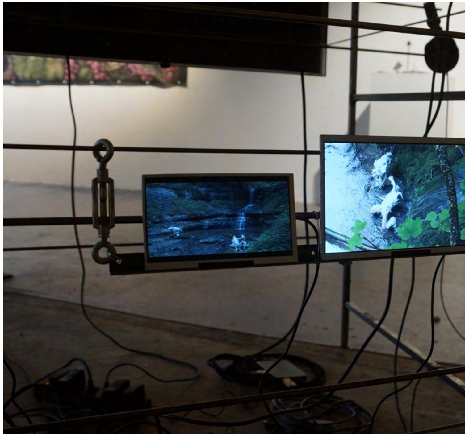
multichannel installation exhibited at quings academy metal, LCD screens, sound 150 x 120 x 170cm

link for shortfilm: https://filmfreeway.com/projects/3301805