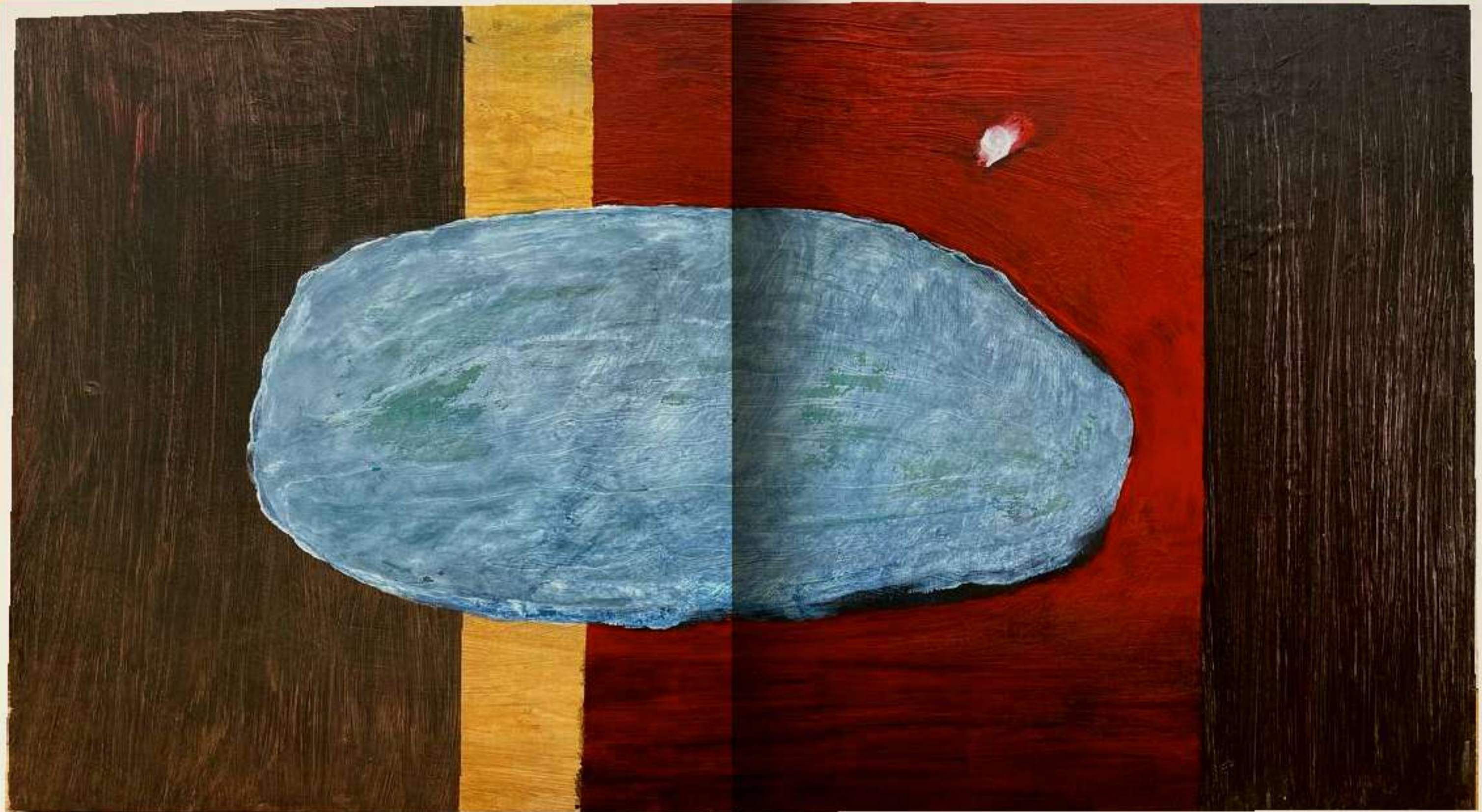
53 «A peaceful cloud in a peaceful sky.»